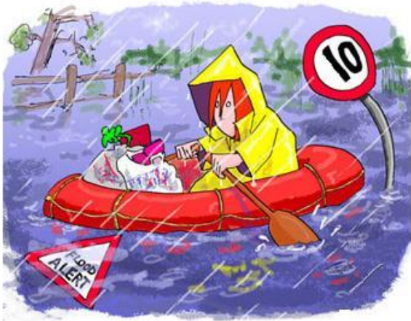
Fireside Room After Last Hard Rain!!

A special need right now is someone with experience in designing drainage. Whenever we get a hard rain we often get flooding in several of our buildings. We need someone with professional experience and training to design a run off system that we can begin to construct. Is that you? Do you know of someone in your congregation who can do this? Please partner with us in improving our facilities.